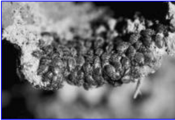
FIG. 1. Swallow bugs ( Oeciocacus vicarius ) clustering at the entrance of an unused cliff swallow nest, apparently in attempts to disperse on the legs or feet of a bird.

overwinter in cliff swallows' nests or in the cracks and crevices of the nesting substrate near the nests. Infestations can reach 2600 bugs per nest, and the bugs affect many aspects of cliff swallow life history (Brown and Brown 1986, 1992, 1996, Chapman and George 1991, Loye and Carroll 1991). Swallow bugs begin to reproduce as soon as they feed in the spring. Eggs are laid in several clutches that hatch over variable lengths of time, ranging from 3–5 days (Loye 1985) to 12–20 days (Myers 1928). Bug populations at an active colony site increase throughout the summer, reaching a peak at approximately the time nestling cliff swallows fledge. The bugs seem to be adapted to withstanding long periods of host absence, in some cases for up to three consecutive years (Smith and Eads 1978, Loye 1985, Loye and Carroll 1991, Rannala 1995). Bugs also parasitize introduced house sparrows ( Passer domesticus ) that occupy nests in some cliff swallow colonies (Hopla et al. 1993, Brown et al. 2001). Swallow bugs disperse between nests within a colony by crawling on the substrate and disperse between colony sites by clinging to the feet and legs of cliff swallows that move from one site to another (Brown and Brown 2004a).